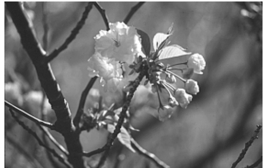
Kwanzan Cherry blossom

URI Foundation 79 Upper College Road Kingston, RI 02881-2023