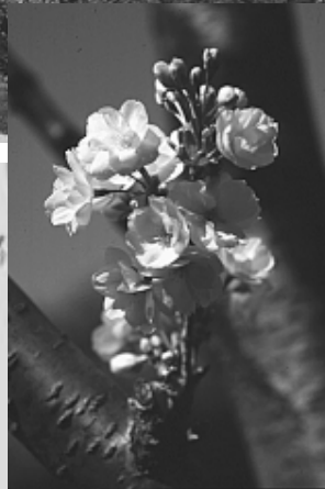
Amanogawa Cherry blossom