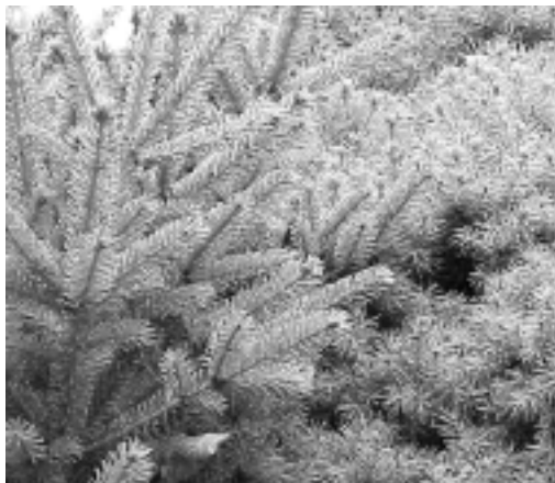
On left: Picea Glauca White Spruce. On right: Picea Glauca 'conica' Alberta Spruce