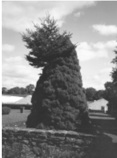
This photo of a URI Alberta Spruce was taken in the URI gardens in 1990. Its odd shape is due to the growth of a branch which has reverted to the original morphology of the larger White Spruce. Because the branch has such a comparatively faster growth rate, the branch has overpowered its dwarf variety.